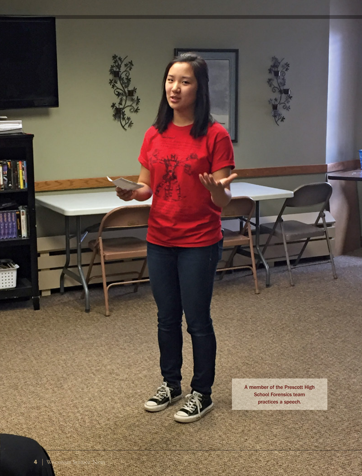
A member of the Prescott High School Forensics team practices a speech.