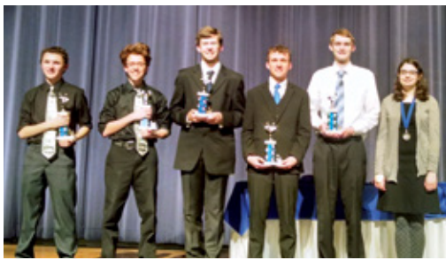
Students from the Lodi High School Forensics team display their hardware after a competition.