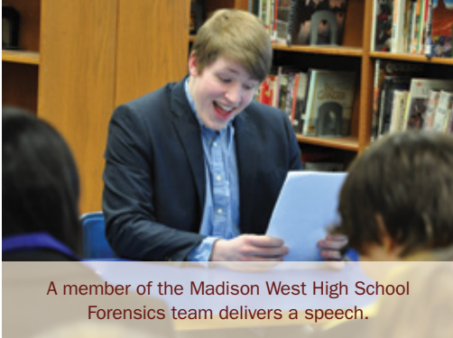
A member of the Madison West High School Forensics team delivers a speech.

School districts can support extracurricular speech activities such as drama, speech and debate in the same way they support athletic activities.